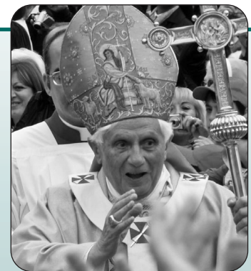
Pope Benedict XVI

Pope Benedict XVI canonized Blessed St. Bernard Tolomei (1272 – 1348) along with Fr. Arcangelo Tadini (1846 – 1912), Br. Nuno Alvares Pereira (1360 – 1431), Sr. Gertrude Comensoli (1847 – 1903) and Caterina Volpicelli (1839 – 1894) in a ceremony at the Vatican on April 26, 2009.