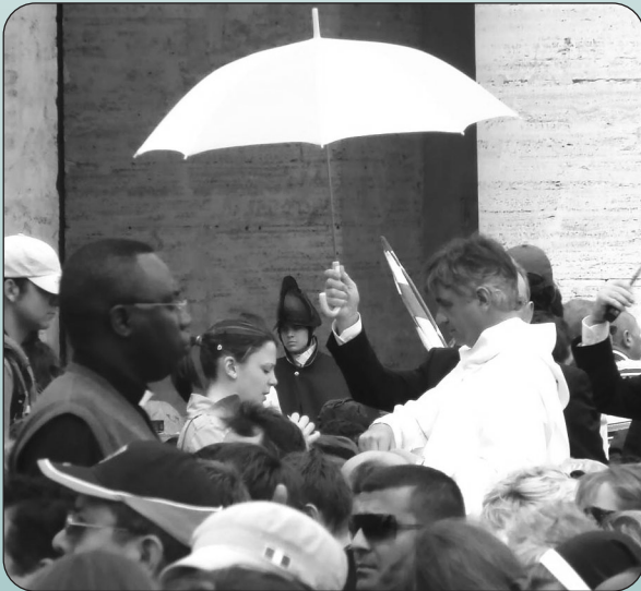
Fr. Henri distrusting Holy Communion

Followers of each saint being canonized wore hats and carried satchels of a different color. Those attending for St. Bernard Tolomei wore white. Other colors were yellow, red, orange and royal blue. As we walked around Vatican City in the days that followed we recognized one another by the identifying color.